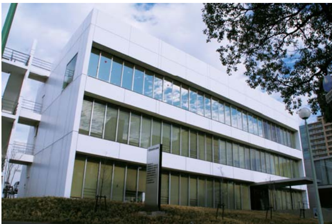
Chibaken Certified Public Tax Accountants' Association Zeirishi-kaikan 3F, 1-16-12, Chuominato, Chuo-ku, Chiba-shi, Chibaken 260-0024 Japan Tel. 81-43-243-1201 Fax. 81-43-248-1951 http://www.chibazei.or.jp/